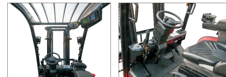
◆ The larger brake pedal and the function of regenerative braking, reduce the fatigue of the driver dramatically.

Good stability and operator comfortability is provided due to low truck gravity. Thanks to the new designed ergonomically small diameter steering wheel, reduce the driver fatigue. 210mm adjustable distance of seat, the steering column can be adjusted for an optimal position in relation to the operator. Softlanding system is equipped, when forks low to 60-100mm to the ground, the soft landing system is auto turn on, which to avoid the damage of the ground and protection to the lifting goods. Newdesigned broad view mast provides better forward view ability. Low noise, no exhaust emission, low energy consumption, are all environment friendly.